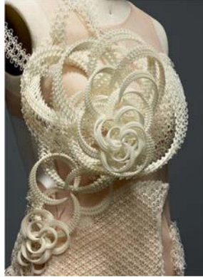
3D-printed threeASFOUR dress, Spring 2016, as displayed in the Metropolitan Museum of Art's "Manus x Machina" exhibit. 14

in San Diego, an annual event attended by over 150,000 people, showcased geek fashion and such innovative creations as the first wearable Lego dress. 13