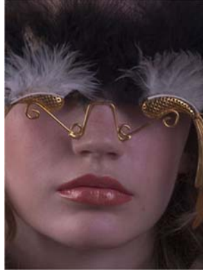
Onoculii Designs eyewear by On Ka'a Davis. 35

acknowledged the inclusion of three-dimensional wearable art within the subject matter of copyright. Indeed, the existence of protection is so clear to those within the industry that some recent instances of copying have not required legal intervention at all, much less litigation, but have instead resulted in withdrawal of the offending items once allegations of infringement became public. 34