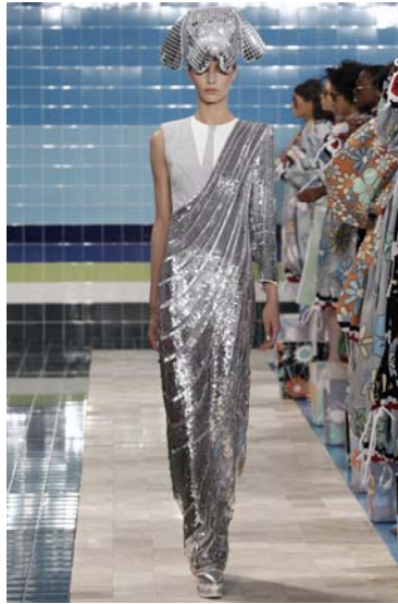
Trompe l'oeil dress by Thom Browne, shown on trompe l'oeil tile "swimming pool" runway, Spring 2017. 53

nothing in the Copyright Act that requires artists who work on such media as walls, ceilings, 3D movies, or dresses to choose either keeping the human imagination in check or being denied legal protection for their work. 52