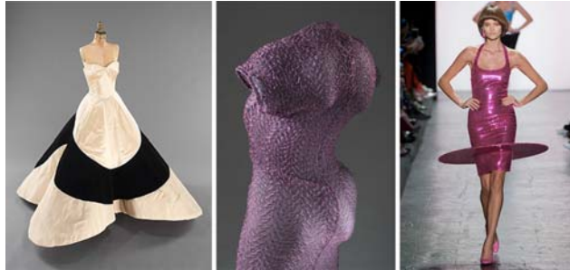
Dresses by Charles James, Rei Kawakubo for Comme des Garçons, Jeremy Scott (L to R).

from copyright protection because the information it conveys is fictional. Cutting-edge designers' experimentation with silhouette, design in the space around the human body rather than on or following the lines of the body itself, is perhaps the most striking reminder that some artistic expression in fashion is closely related to sculpture. 47 No human body is actually the shape of Charles James' famous 1953 "Clover Leaf" gown, 48 Rei Kawakubo's controversial padded and distorted shapes from Spring 1997, 49 or the flying saucer dresses that Jeremy Scott sent down the runway for next spring 50 – and the advent of 3D printing continues to expand the creative possibilities.