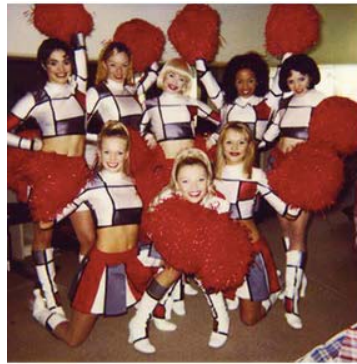
Mondrian-inspired cheerleader costumes (1988). 43