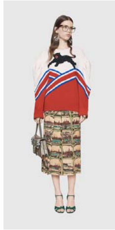
Gucci sweater, designed by Alessandro Michele (2016).

The assessment for copyright purposes of other information conveyed through clothing, too, is independent of whether or not it is true in certain limited contexts. A brightly colored article of apparel with a print or design composed of colorblocking and stripes may call to mind a cheerleader, collegiate athletics in general, or a runway look from the current Gucci collection. 51